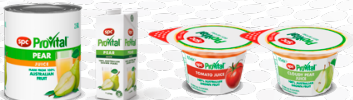
Portion Control Tomato

SPC ProVital® Juice is made from 100% Australian fruit, grown in the Goulburn Valley of Victoria and contains no artificial colours, or preservatives. Pear available in 105mL, 1L and 2.9L, or Tomato available in 105mL.