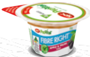
Apple & Prune 120g x24 #01708770592x