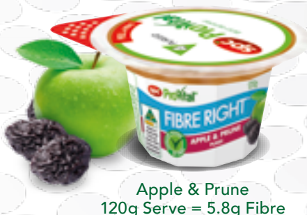
Apple & Prune 120g Serve = 5.8g Fibre