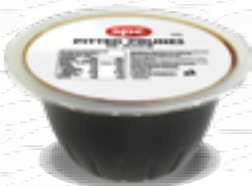
Pitted Prunes in Juice 100g x 24 #01719027906