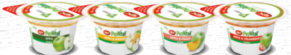
Apple 120g x24 #01708780592x