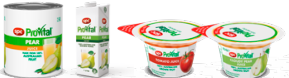
Pear Juice 2.9L x3 #01102826592