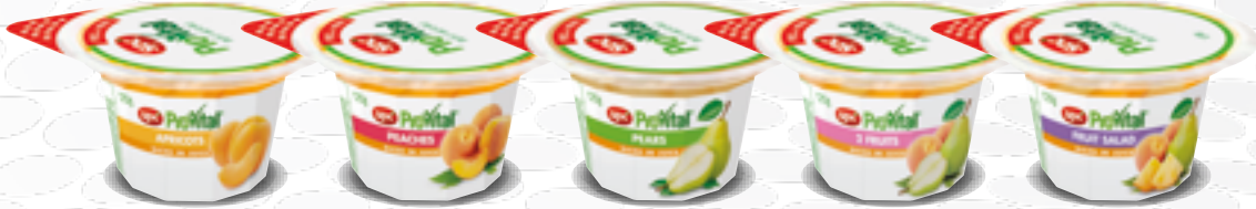
Apricots 120g x24 #01703427592x