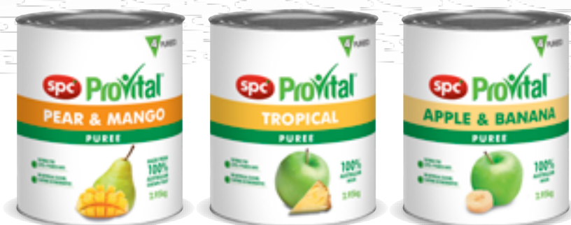
Pear & Mango