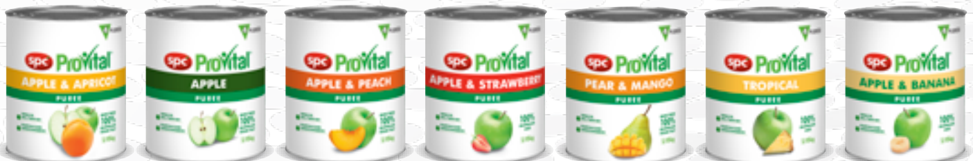
Apple & Apricot 2.95kg x3 #02108784592